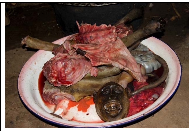
Fig. 3. Sykes monkey on the menu. taken in one of the villages surrounding NDUFR.

Elephants, buffaloes, lions, and hyenas were recorded only in WKSFR. Medium-sized species (>16 kg) such as bush pig, Abbott's duiker, and aardvark were significantly less abundant in both hunted areas. Smaller ground-living species had the lowest relative density in the area with the highest level of hunting, while two of three primate species were approximately equally abundant in the two hunted areas. To protect the astounding biodiversity of WKSFR, the Ndundulu, and Nyanbanitu forests and the adjacent Matundu and Iyondo forest reserves have recently been gazetted as the Kilombero Nature Reserve [62]. The status as nature reserve is the highest protection under the Tanzanian Forestry and Beekeeping Division legislation, equivalent to the National Park status of the Tanzania National Parks Authority.